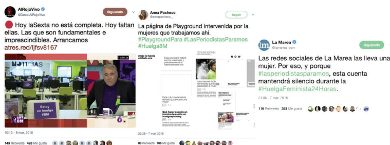
FIGURE 3 REPERCUSSION ON TWITTER OF THE ABSENCE OF WOMEN IN THE MEDIA