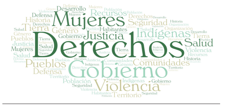
FIGURE 1 MOST USED WORDS IN THE TEXTS PUBLISHED BY THE MEDIA ALLIANCE ON THE FIRST SEMESTER OF 2019