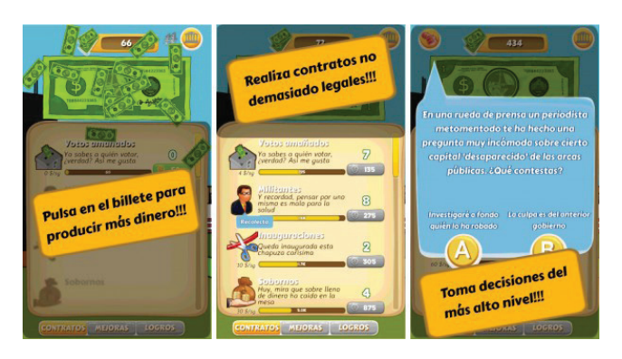
FIGURE 2 ALCALDE CORRUPTO BASES THE CRISIS ON ITS TEMPORAL ANCHORAGE

All of the video games analyzed start, in one way or another, from a local Spanish reference world to generate their ludic world. Specifically, the four most relevant frameworks are the news events that had a relevant impact on public opinion, the logic of the crisis in the Spanish cultural context, the relevant political figures, and the electoral model. In the first case, the game Safari King creates its world from the incident that King Juan Carlos starred in when he broke his hip after an elephant hunt in Botswana. In the same line, the news about corruption linked to Luis Bárcenas, former treasurer of the Partido Popular (Popular Party) inspires the intellect and the conformation of the ludic space of the titles Chorizos de España and Darsenas, Tesorero Corrupto. In the case of the crisis logics, proposals such as Marea Verde build their persuasive model precisely as a criticism to the cuts in primary and secondary education, while Alcalde Corrupto identifies the illicit activities in the contracting of local urban development projects as the basic foundation of the recession and the fall of the economic-social model